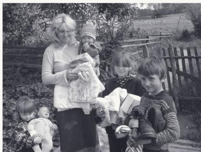
A new family in HART's Child Sponsor Project who received gifts & clothing along with food. Currently, we have close to 300 children in this project.