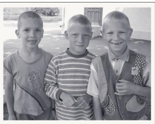
HART sent hundreds of children to summer camp this year, including kids in the Child Sponsor project, orphans, and street kids.