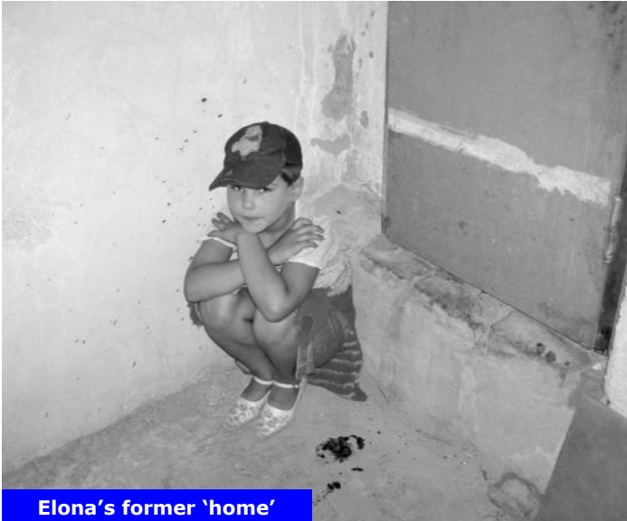
Elona's former 'home'