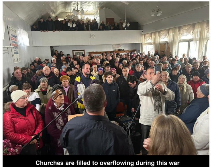
Churches are filled to overflowing during this war

The Church will not stop sending volunteer chaplains to the front lines, standing in solidarity with Ukrainian soldiers throughout the horrors of war, sharing in their difficulties and risks, providing solace, and offering a message of hope during their darkest moments.