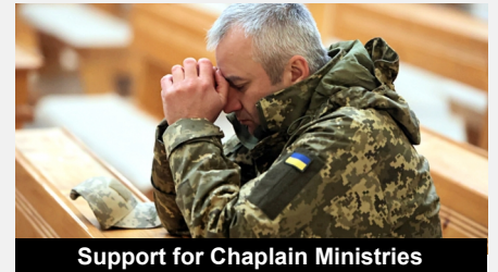
Support for Chaplain Ministries

Together we ARE changing hearts, restoring hope, & saving lives during this crisis in Ukraine. Thank you dear friends.