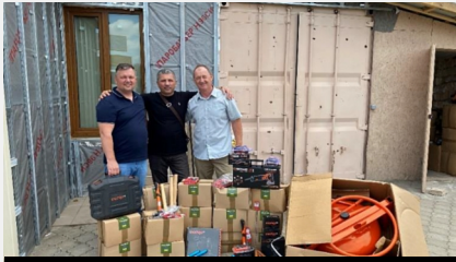
Construction material for church repairs