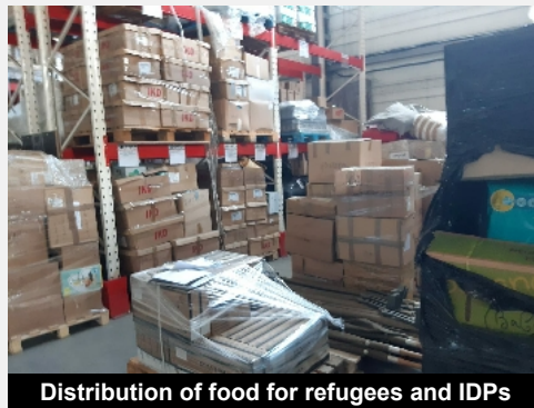
Distribution of food for refugees and IDPs