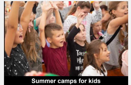
Summer camps for kids